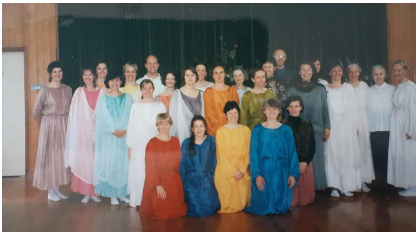
1996 Melbourne Eurythmy School, AURORA AUSTRALIS