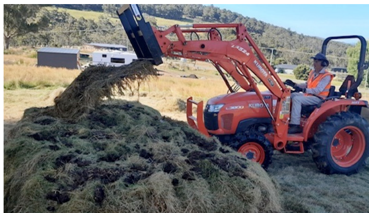
Greg on the tractor, building a compost heap.

Our composting procedures are now streamlined with a dunking pool for wetting the material. Marcus and Greg have been using the tractor to build some shared BD compost piles. The compost will be used to enhance the soil on the 'Little Farm' enterprise adjacent to the Raphael land, the Raphael orchard and vegies next season.