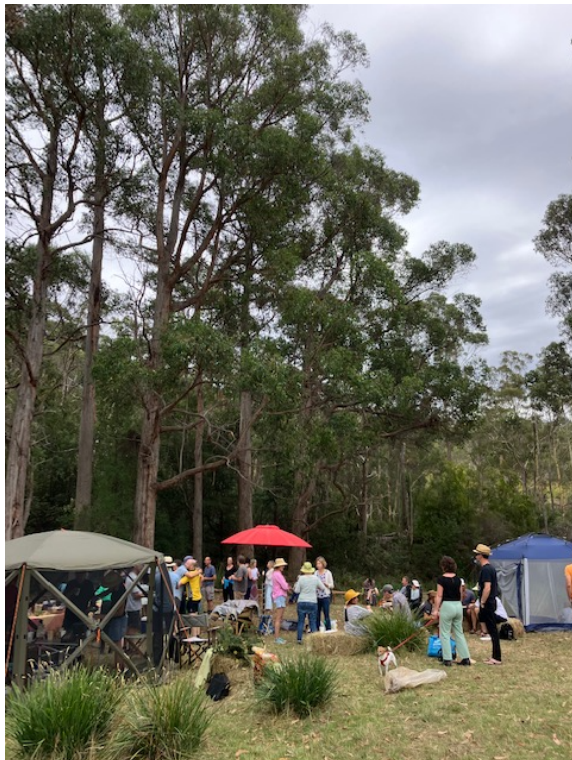
A festive gathering of friends and Neighbours.