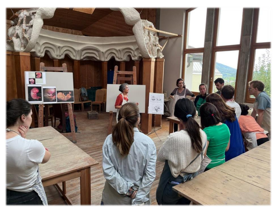
Goetheanum, September 2022