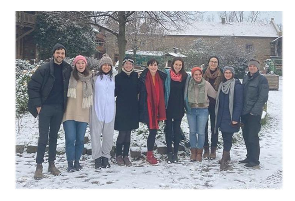
Dottenfelderhof, December 2022

The workshops are intentionally being kept small to promote active engagement with the content and each other. Therefore, we recommend registering soon to secure first choices. For those unable to participate in person, we are planning a small online programme. Please register <a href="here to receive updates">here to receive updates</a>. We encourage those interested to start preparing for this conference and welcome everybody to join our fortnightly online study group of the Course for Young Doctors lectures. You can sign up on our website (<a href="www.yiam.world">www.yiam.world</a>) where you can also get in touch about receiving the warmth meditation as an esoteric form of preparation. All other questions are also welcome.