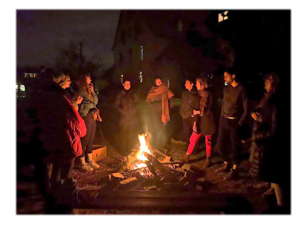
Dottenfelderhof, April 2022