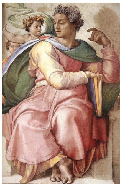
Michelangelo: Isaiah from the Sistine Chapel

In each session there will be a half-hour consideration of the two themes, which will complement each other and set a mood of soul for participants to work with over the ensuing night and day. The final minutes of the session will be for any further considerations and nuances that will help grow the work over the Christmas season in preparation for the coming year. The hope is that each day will have the nurturing aspect of a retreat for resetting our soul for the work in the coming year.